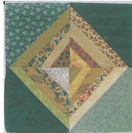
FALL SQUARES 10" (10 1/2" unfinished)

Fabrics : Background triangles are 3 shades of green print. Two are dark green print, one is medium green print and one is med. light print. Look at diagram for placement.